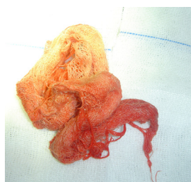
Figure 4. Extracted material is seen.